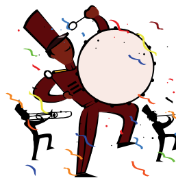
CCHS Band advances to Regional October 18 at Chesterton, Indiana

School receiving GOLD rating! They advanced to Regional and perform on October 18 at Chesterton, Indiana at 6:48 P.M. The season will culminate on November 1 at ISSMA State Finals