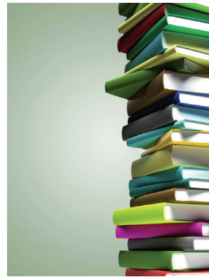
Book Fees are due by the end of each trimester.